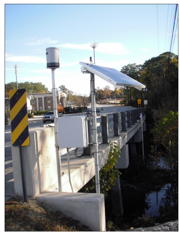
The GIL-A Monitoring Station